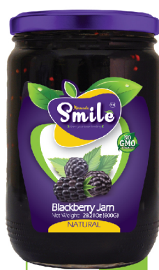
Item #MJ103 (12) Box