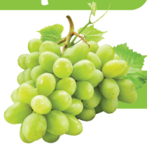
Natural Grape Vinegar