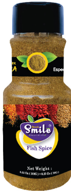
Fish Spice بهارات سمك Especias para Pescado