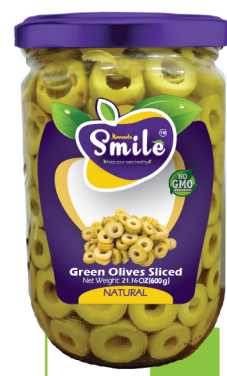
Item #Mo208 (12) Box