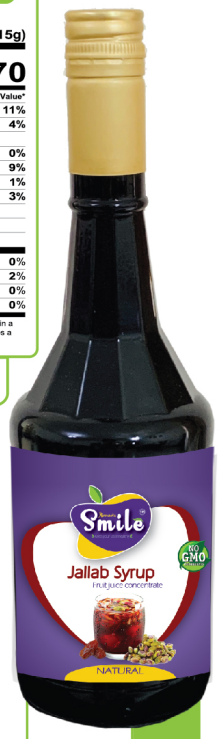
Item #MF402 (12) Box