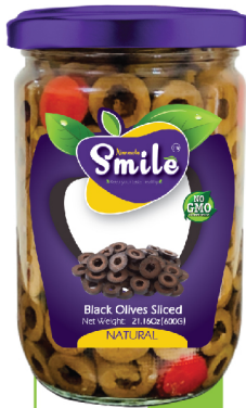
Item #Mo209 (12) Box