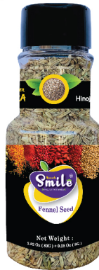
Fennel Seed شومر حب Hinojo En Granos