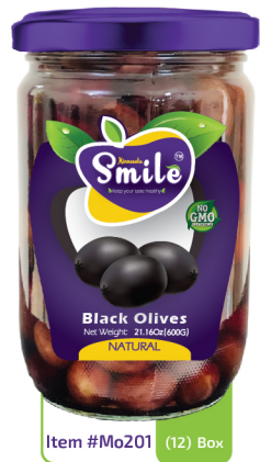
Item #Mo201 (12) Box