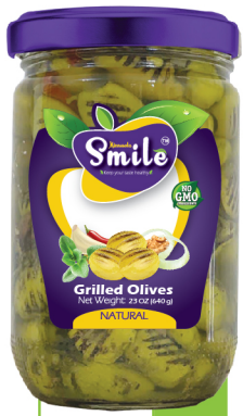
Item #Mo210 (12) Box