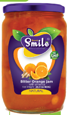
Item #MJ101 (12) Box