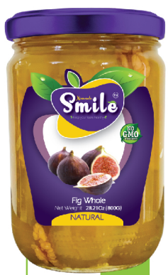
Item #MJ114 (12) Box