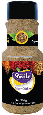
Crispy Chicken بهارات كرسبي Especias Pollo Crujiente