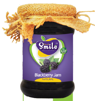
Item #MJ102 (12) Box