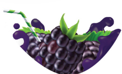
Blackberry Syrup Fruit Juice Concentrate