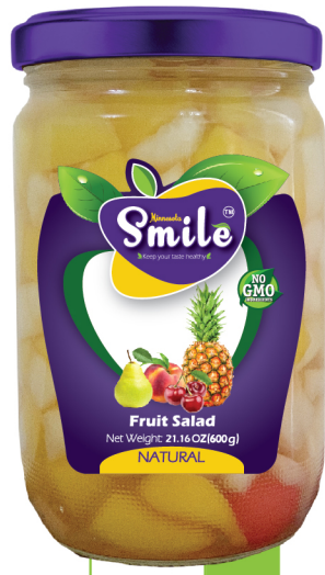
Item #MP317 (12) Box