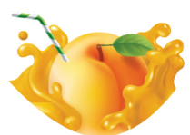
Apricot Syrup Fruit Juice Concentrate