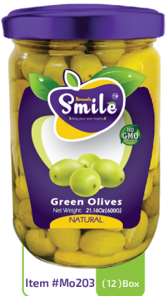
Item #Mo203 (12) Box