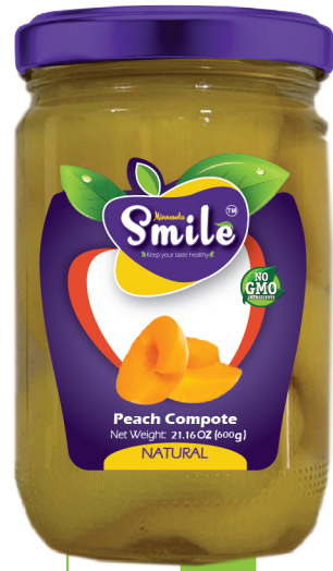
Item #MP318 (12) Box