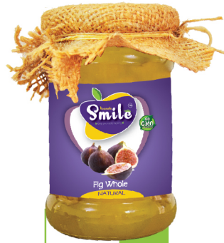
Item #MJ113 (12) Box