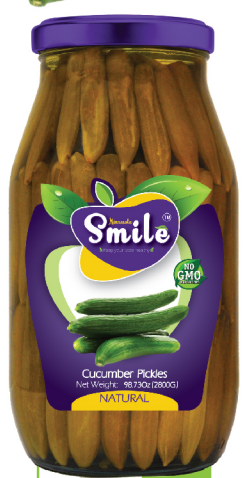
Item #MP300 (4) Box