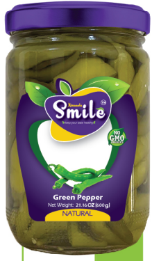
Item #MP310 (12) Box