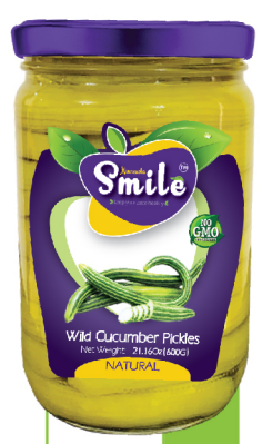
Item #MP304 (12) Box