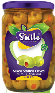
Item #Mo205 (12) Box