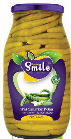
Item #MP303 (4) Box