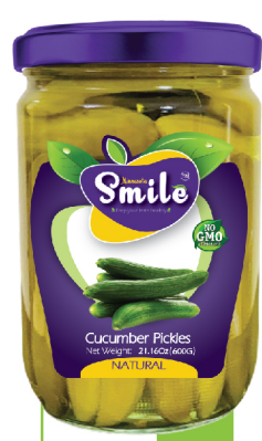
Item #MP301 (12) Box

INGREDIENTS: Wild Cucumber, Water, Salt, Acetic Acid .