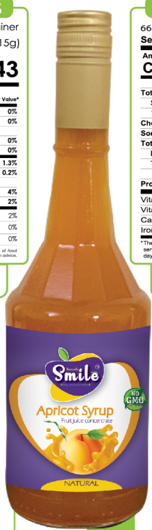
Item #MF400 (12) Box