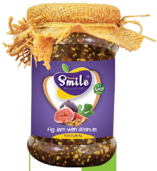
Item #MJ111 (12) Box