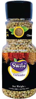
Coriander كزبرة حب Cilantro