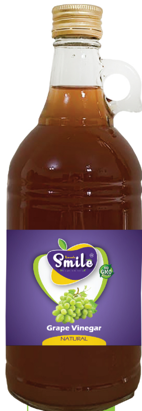
Item #ML505 (12) Box