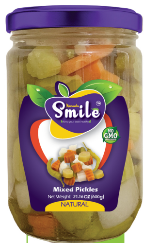
Item #MP307 (12) Box