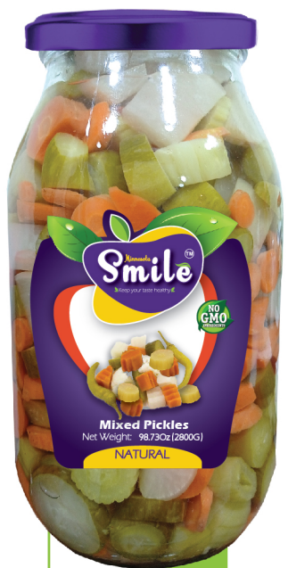
Item #MP309 (4) Box