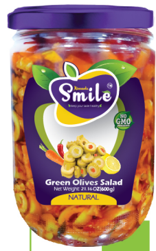
Item #Mo211 (12) Box