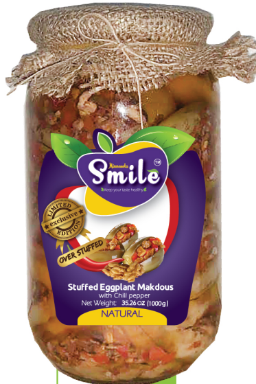
Item #MP315 (12) Box