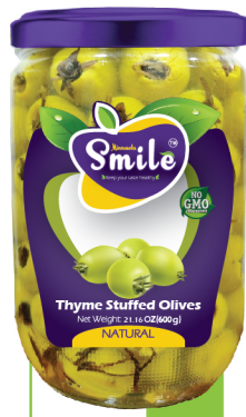
Item #Mo207 (12) Box