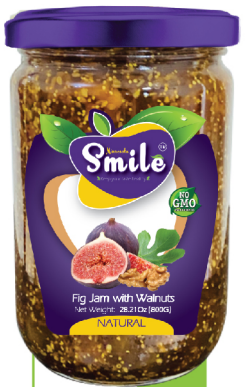
Item #MJ112 (12) Box