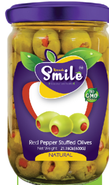
Item #Mo206 (12) Box