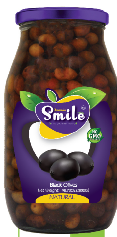
Item #Mo200 (4) Box