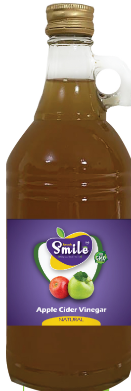
Item #ML506 (12) Box