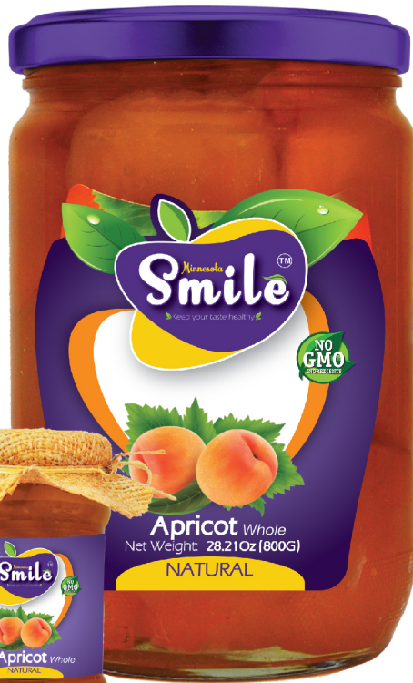
Apricot Whole Jam