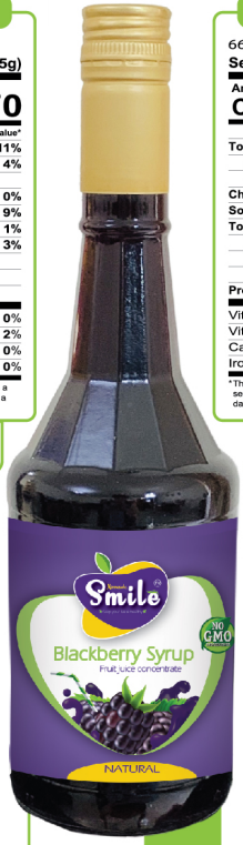
Item #MF401 (12) Box