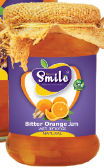
Bitter Orange Jam