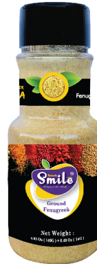
Ground Fenugreek حلبة ناعمة Fenugreek Molido