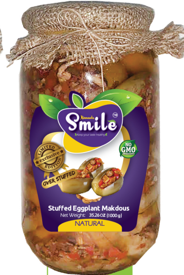
Item #MP314 (12) Box