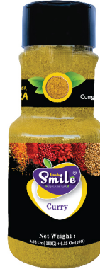
Curry كاري Curry