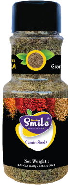
Cumin Seeds كمون حب Granos De Comino