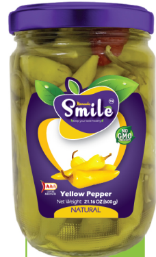
Item #MP311 (12) Box