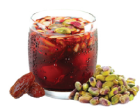
Jallab Syrup Fruit Juice Concentrate

Rose Water, Sugar, Dates and Raisin Extract, Citric Acid, Caramel Color, Natural Rose Flavor R 40 .