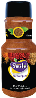
Fajita Spice فاهيتا Especias Pollo Fajita