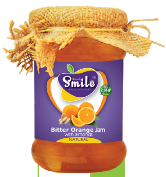
Item #MJ100 (12) Box