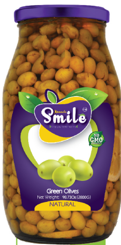
Item #Mo202 (4) Box